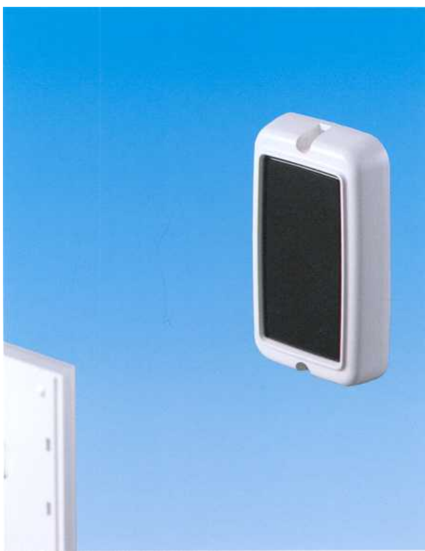
Utility model: 1, Design: 1 - Registered